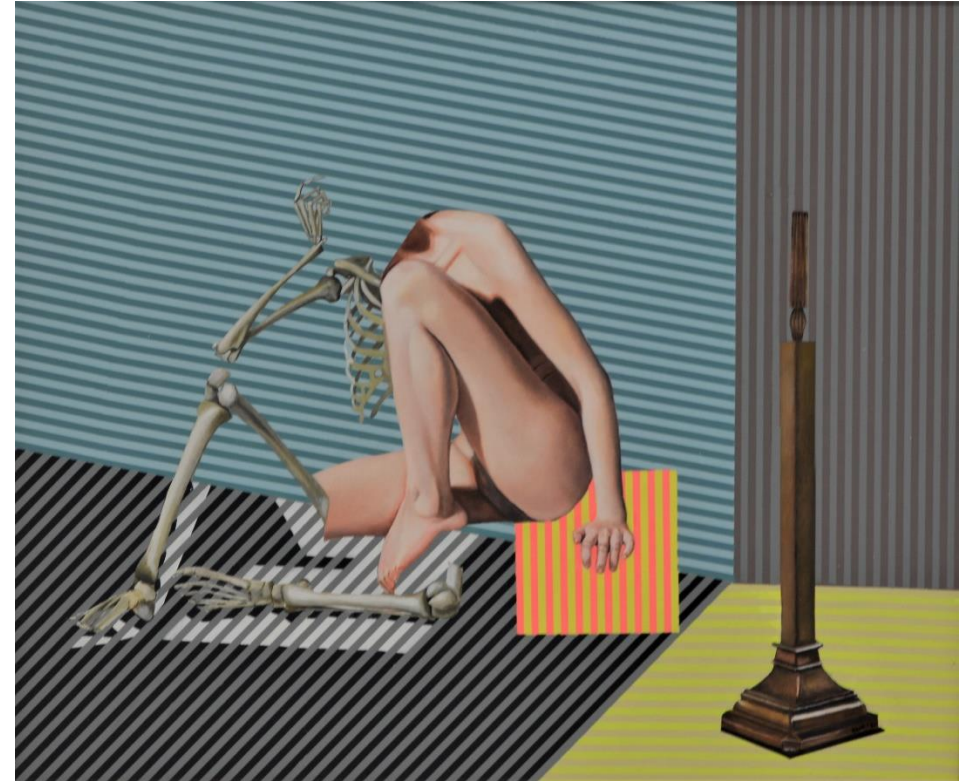
Bravado to reveal the hidden Acrylic paint on board 49cm X 59cm 2020 R6 000