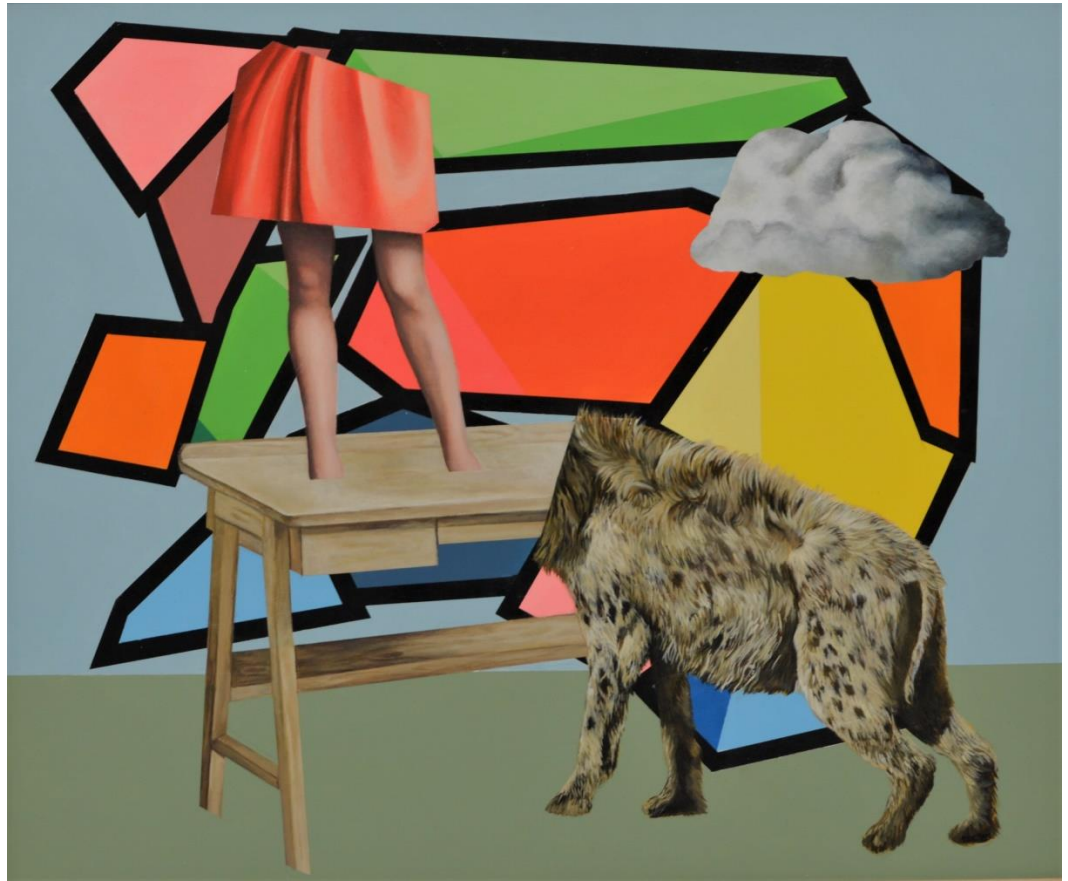
The dazzling assumption Acrylic paint on board 49cm X 59cm 2020 R6 000