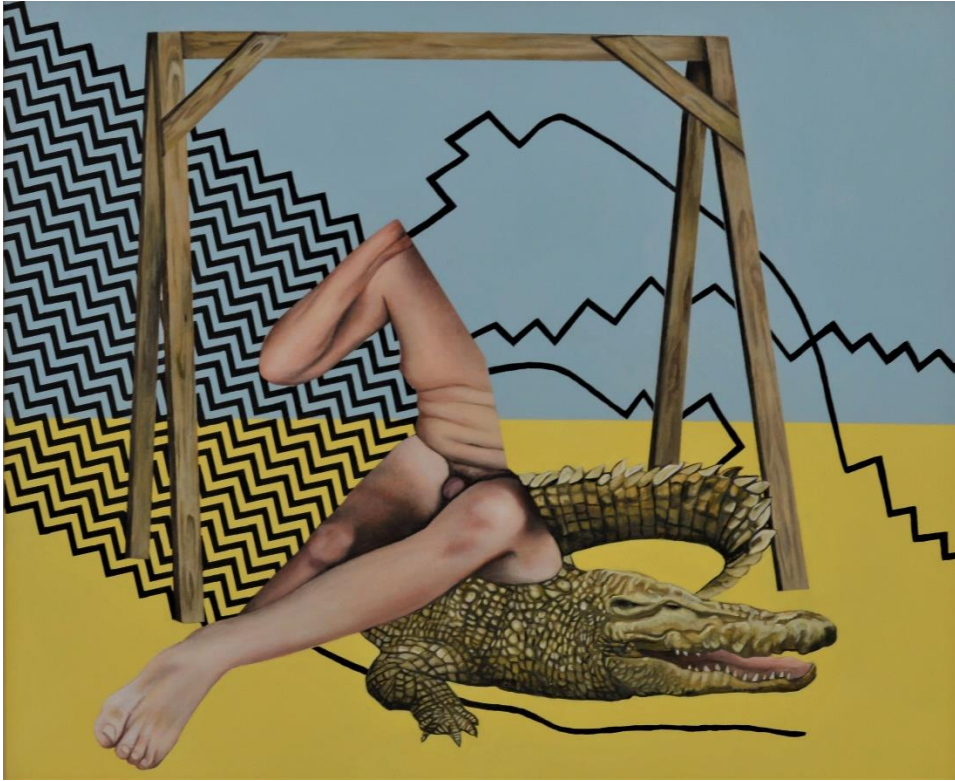
Auto-ascetic Acrylic paint on board 49cm X 59cm 2020 R6 000