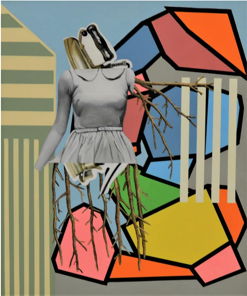
Conditions of irrationality instead Acrylic paint on board 59cm X 49cm 2020 R6 000