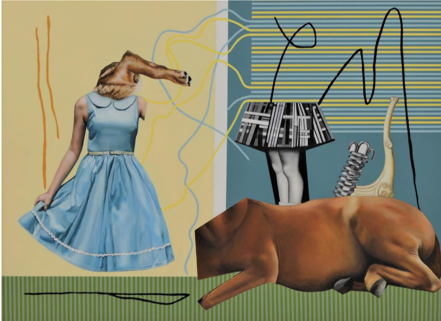
Radical little parlour game Acrylic paint on board 69cm X 93cm 2020 R10 500